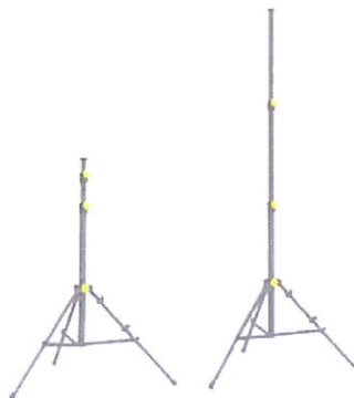
Picture: SCANGRIP TRIPOD EX.

The tripod is made of durable and sturdy powder coated steel. To increase safety when in use, cables can be positioned in the safety clips placed on each of the tripod legs. The cable winding device are for excess wire.